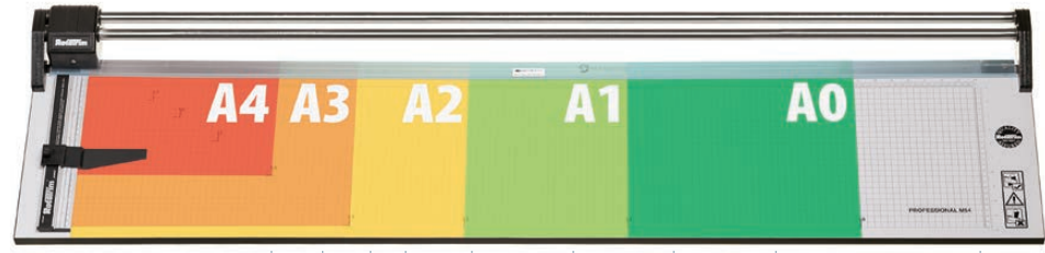
M SERIES CUT LENGTH M12 M15 M18 M20 M24 M30 M36 M42 M54